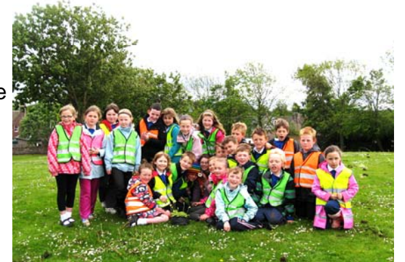
Children from Milnathort Primary planting wildflower plugs

The Primary 4 class from Milnathort Primary took part in a wildflower planting afternoon on the 26th May where they learned about improving biodiversity. Areas of grass in Donaldson Park are to be cut less often and the wildflowers and bulbs will be allowed to grow. The flowers will self seed and take a while to become established. This activity was part of the National Biodiversity Week and each child was given a packet of wildflower seeds. In October a group also