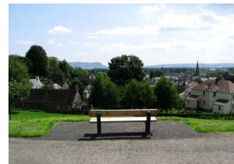
New bench at Ba' hill

Landscaping has been done and the new seats are now in place at Ba' Hill so people can take advantage of admiring the great view from this viewpoint.