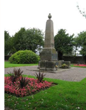
War Memorial planting

A range of improvements have now taken place in Donaldson Park including installing a youth shelter, a springie, a roundabout, landscaping, planting and the entrance is to be upgraded. The youth shelter is for people to sit in and is not a piece of play equipment to be climbed on, therefore there is no safety surface underneath. As well as being used by teenagers, the youth shelter has received unexpected popularity with local dog walkers who are enjoying a new place to meet!