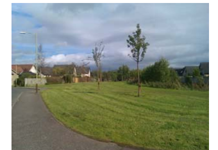
Trees at Auld Mart

Trees were planted on the open space area at Auld Mart. We had planned to also add seating to the area but decided the seating would be too close to the housing and users could disturb residents in the area.