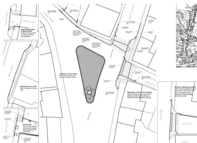
Wester Loan: proposed improvements

The footpath at Burleigh Road was recently resurfaced and various options are still being investigated to lower vehicle speeds in the area.