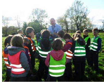
Biodiversity Officer with children from Milnathort Primary

You may have noticed that long areas of grass have been left around the trees in our parks. These have been planted with wildflowers and are to encourage biodiversity in the area. These areas will be cut once a year.